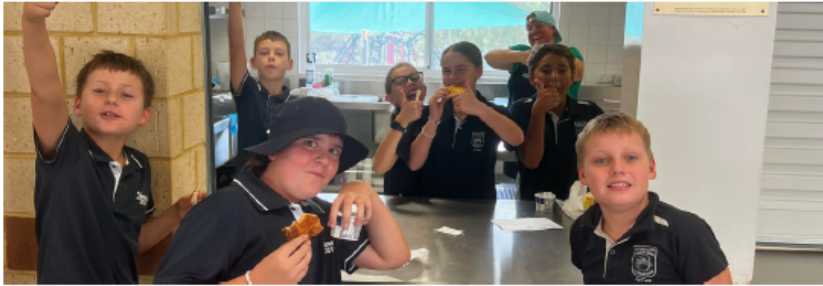
FRIDAY CANTEEN MAYHEM